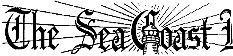
Exhibit for Minutes Ord. 603-10-2015

POST OFFICE BOX 2009 BAY SAINT LOUIS, MS 39521-2009